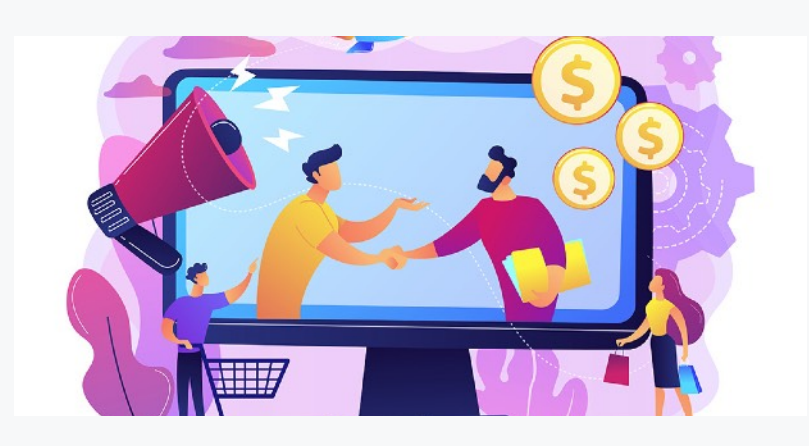
Tips : Collaborate with bloggers or influencers in digital marketing.